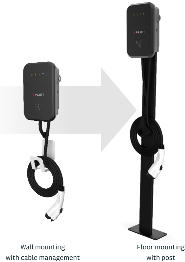
Wall mounting with cable management